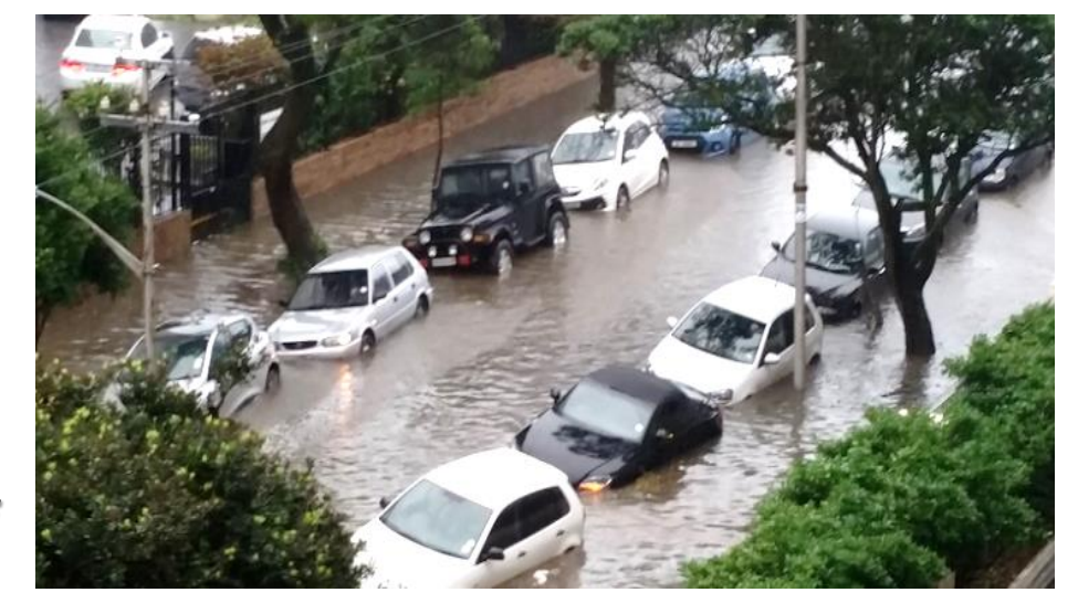
Flooding in Johannesburg, South Africa

The primary responsibility for DRM in South Africa rests with the government. In terms of the Constitution of South Africa, all spheres of government are required to "secure the well-being of the people of the Republic".