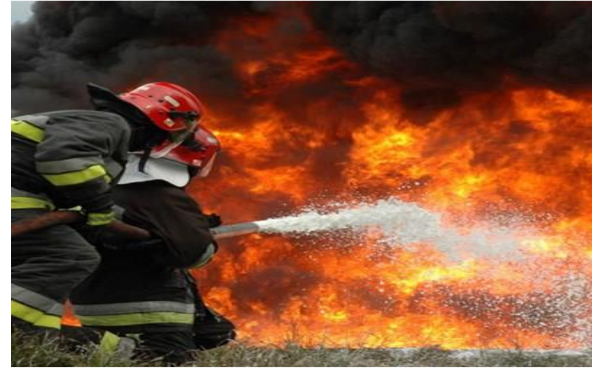
Firefighter 'holding the line' - Knysna Fire, 2017

Relief must be provided directly to the affected to reduce political interferences.