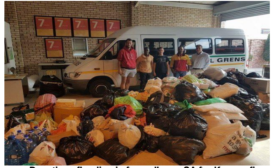
Donations flooding in from all over SA for Knysna fire victims