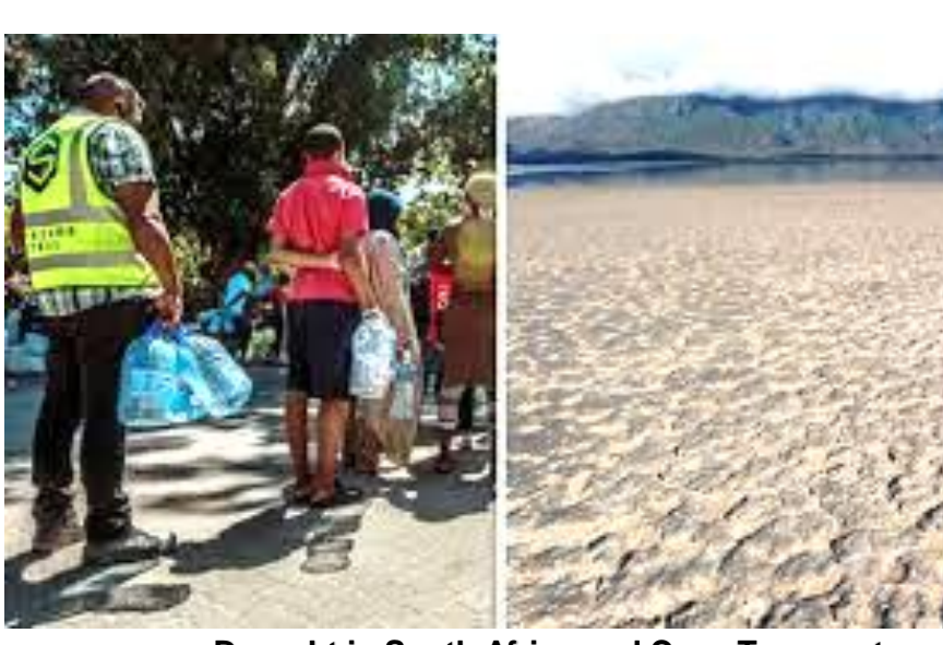
Drought in South Africa and Cape Town water crisis

DRM is listed as a functional area of the Constitution - that both the national and provincial spheres of government are competent to develop and execute laws within this area and have powers and responsibilities in relation to DRM.